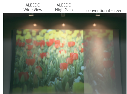
Comparison under the downlight